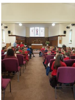
The Wider Curriculum

Our Collective Worship is Christian-based but not exclusively so. A regular religious assembly is held as a whole school. It is an important part of our school day. Visitors are invited to take our assemblies. The school has no affiliations to any specific religious order but does have regular contact with the local church. We are extremely fortunate that our local church attends school regularly with 'Open the Book' volunteers, to retell stories from the Bible. Parents may request their child to sit out of these assemblies.