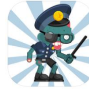
Math Vs Zombies Free (iOS) Free (Google)