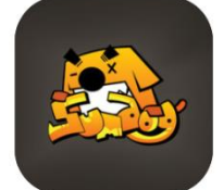
Sumdog Free (iOS) Free (Google)